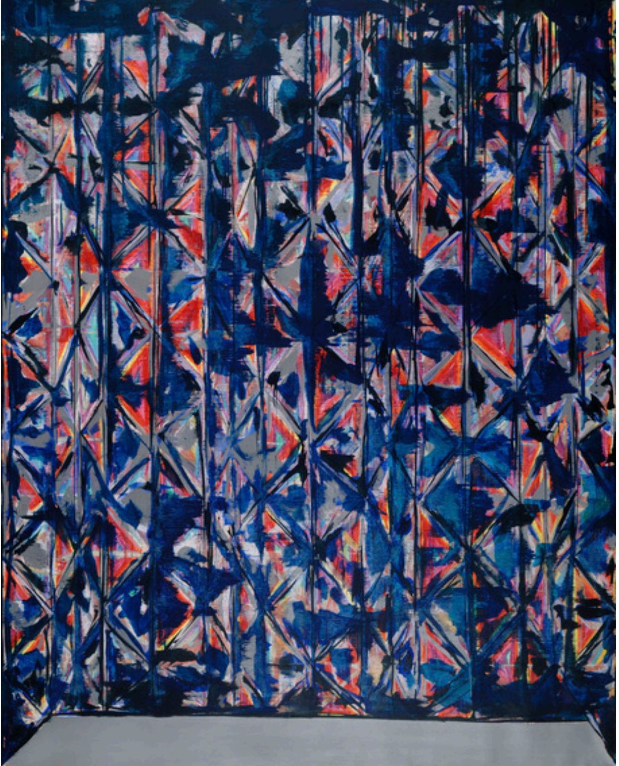
Elevator , 2011. Oil on linen. 90x72 in.

Upstairs at Silas Marder is Elevator , the large showpiece of the exhibition: A blue shaft covered with a red diamond grill gate that sits on a flat grey wedge. This grey wedge forms a metallic platform that juts into the bottom of the painting creating a threshold; a space the viewer can figuratively enter.